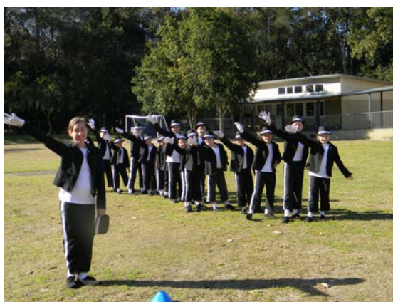
Star Struck dancers