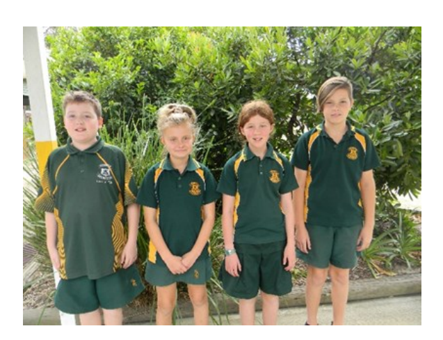
2019 School Captains